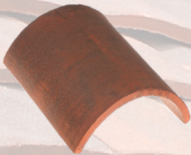
Half Round Ridge