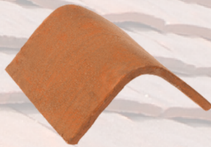
Hog Back Ridge